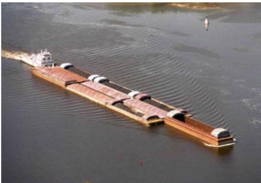
A coal barge delivers coal to the Genoa Power Station in Genoa, WI, on the banks of the Mississippi River. The Genoa Plant burns around 1 million tons of coal annually.

Officials at Dairyland are hopeful that prices will level off for coal supplies in late 2002, but time will tell. Coal has been a lower-price resource for many years, and its price is now starting to escalate.