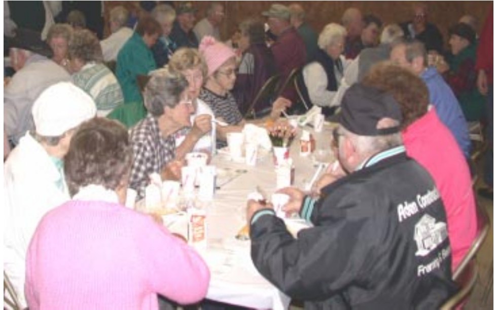
Cooperative members enjoy their lunch, which was provided by Clark Electric and other local cooperatives. The luncheon is held annually to celebrate Cooperative Month.

This year, more than 600 members attended the luncheon. They enjoyed brats, hamburgers, hot dogs, beans, sauerkraut, and various cheeses from the local dairies, along with ice