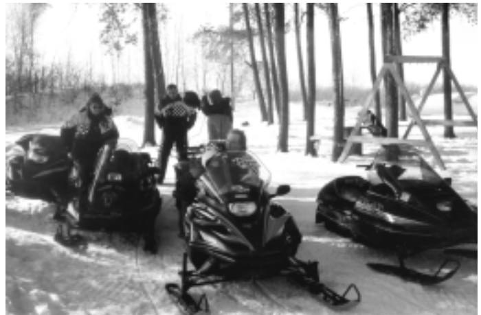
A trip one day to Dale's North Mound with friends. This is just one of the many great places you can visit on the trails in Clark County.