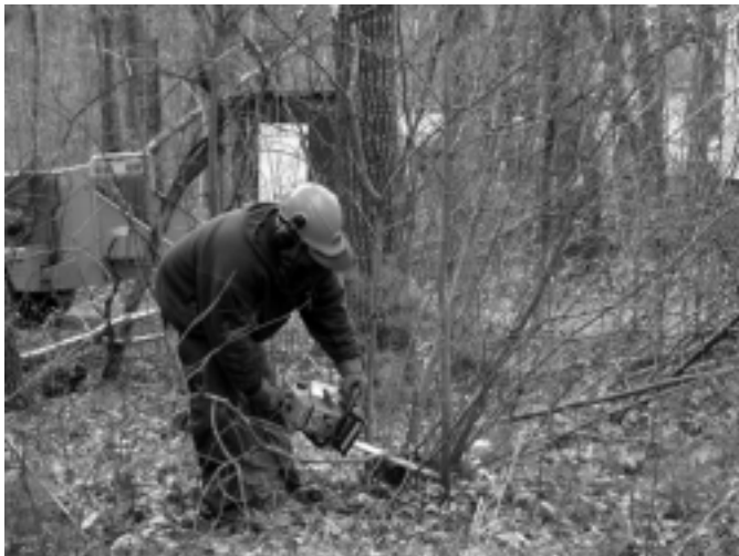
Clearing brush near Mead Lake. A crew member from New Age Tree Service is clearing brush under and around the electric right-of-way to help in electric reliability.

2001 looks like it will be a good year for the cooperative. Sales were higher, caused by the extreme heat of last summer. Expenses, of course, were also higher. Bad storms in late spring and early summer