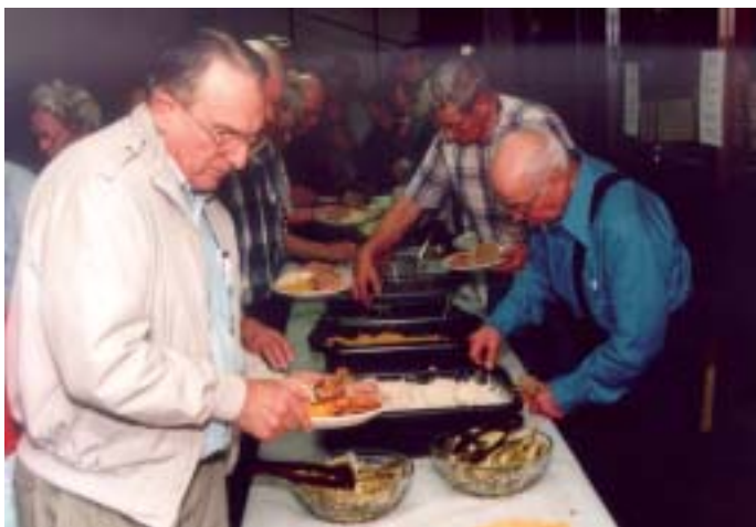
As always, there will be a great meal served by the Loyal American Legion and the great people of that organization.

2003 ended up to be another good year for the cooperative. Our margins are down from last year, but higher than anticipated. It was a good year for sales, and Dairyland Power Cooperative's margin allocation was much higher than expected. These, coupled with our late, year-end rate increase (two months), improved our financials.