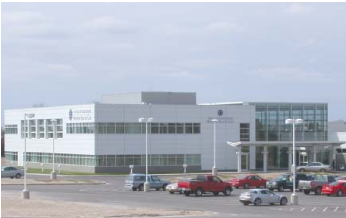
Our Lady of Victory Hospital located in Stanley, Wisconsin, on State Hwy. 29 and County Hwy. NN. The hospital has complete emergency services and rehabilitation services, along with a new dialysis unit.