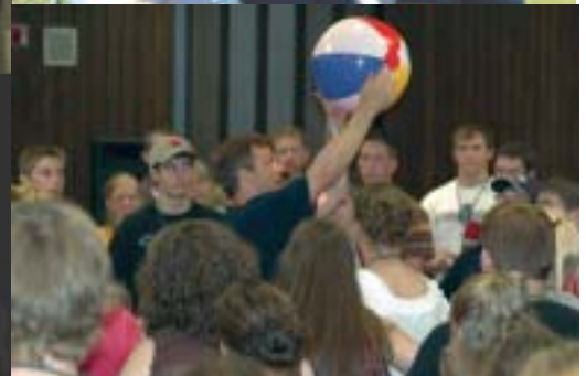
Clark Electric's representatives at the Youth Leadership Congress are pictured at the top. Following are scenes of various activities that revolved around cooperative principals.