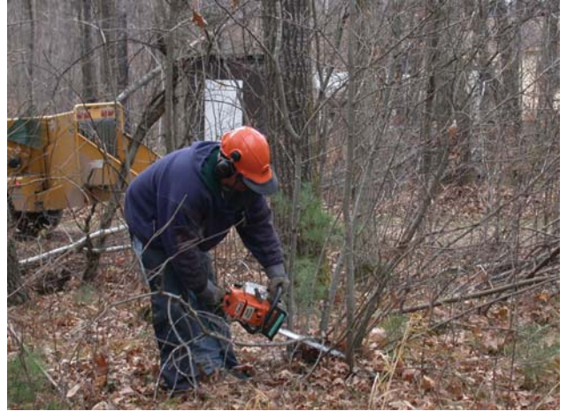
Keeping power lines clear of trees and brush helps to prevent unwanted nuisance outages, which cost the cooperative time, materials, and headaches.

When crews clear brush and trees from the right-of-way, they keep a 15-foot clearance on both sides of the line structure. Keeping proper clearance helps to prevent unnecessary blinks or outages. To help prevent future trimming and cutting, be careful when planting trees or large shrubs. Do not plant them under power lines, and be sure they will stay clear of power lines as they grow. If you have any questions about tree trimming, please call the Operations Department at 800-272-6188. ■