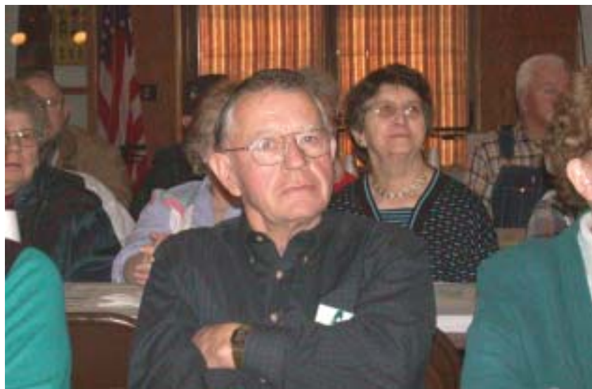
Former board president and other members listen intently to the speakers and their messages to the cooperative members.