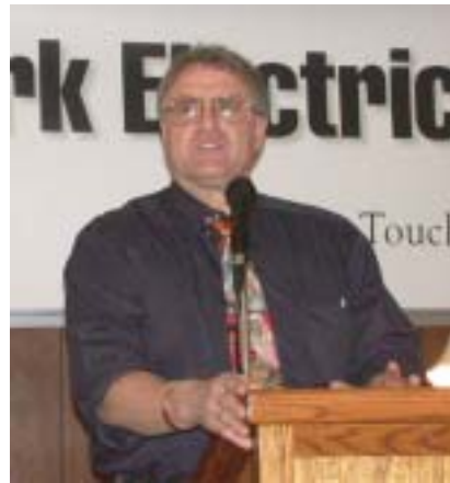
State Senator Dave Zien addresses the membership on political issues that are important to all citizens.