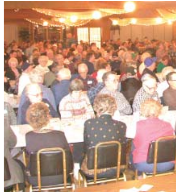
Members of Clark Electric Cooperative listen as many speakers address the group.