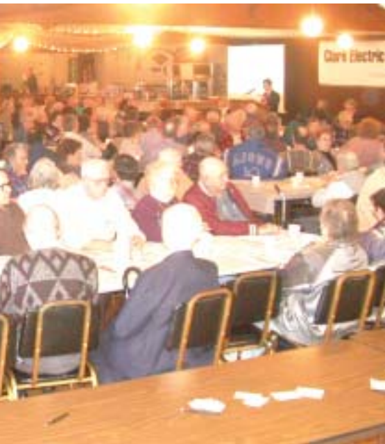
Speakers inform them of matters pertaining to their co-op.