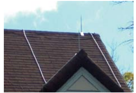
This member's house had lightning rod and assorted equipment installed by con artists posing as Clark Electric employees.

Contractors who normally are in the area are tree trimmers, meter testers, pole testers, underground